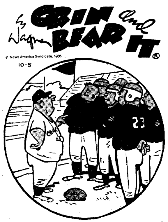
"For those of you who are concerned about drug tests, tutors will be provided."