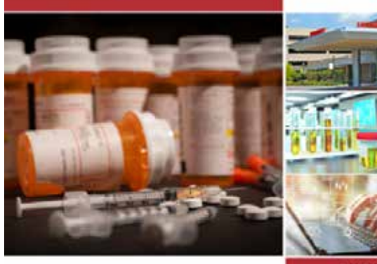
APHL Opioids Biosurveillance Task Force Model Opioids Biosurveillance Strategy for Public Health Practice

In 2020, the OBTF began exploring the public health laboratory role in surveillance of Neonatal Abstinence Syndrome (NAS). APHL added several new members with expertise in neonatal drug testing, newborn screening, NAS epidemiology and surveillance, pediatrics/neonatology, obstetrics/ gynecology, and state maternal/child health programs to the OBTF in support of this effort. The OBTF is currently developing a statement which will provide context into the landscape of NAS surveillance data and its utility, existing neonatal drug testing methods, and ethical, social, and legal implications of laboratory-based NAS surveillance.